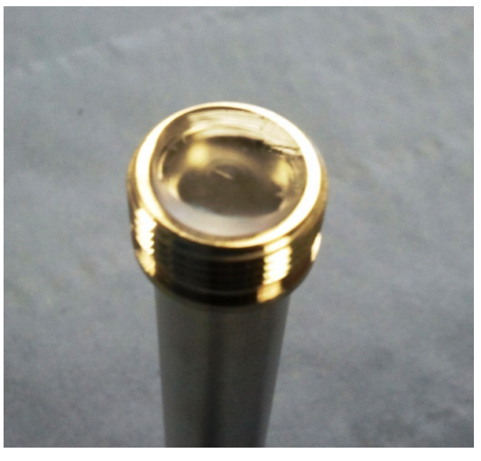
Figure 4 - PDMS membrane pushed evenly into the reservoir

6. Place the membrane holder on top of the PDMS membrane, with the smaller face uppermost and making sure it is centred.