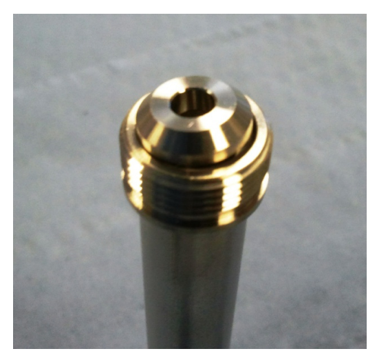
Figure 5 - The membrane holder is positioned

6. Place the membrane holder on top of the PDMS membrane, with the smaller face uppermost and making sure it is centred.