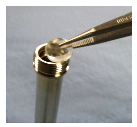
Figure 3 - Inserting the PDMS membrane

5. Using clean tweezers, insert the PDMS membrane into the top of the reservoir and ensure that it is evenly pushed down. ** Be very careful not to damage the membrane **