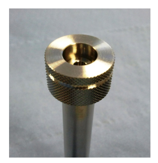
Figure 6 - The lid is screwed on

7. Carefully screw the lid onto the reservoir of the Wafer Device.