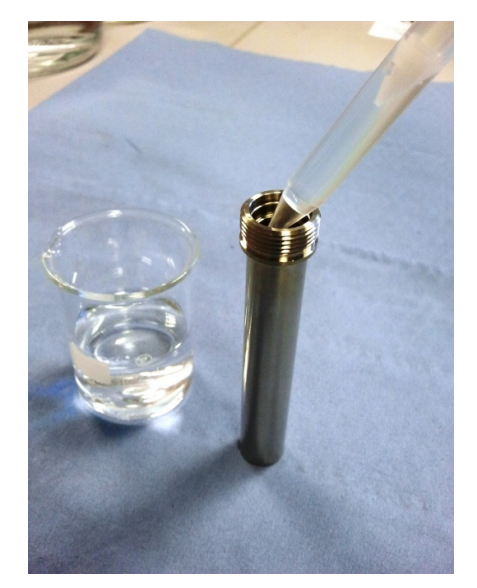
Figure 2 - Adding the chemical to the Wafer Device reservoir