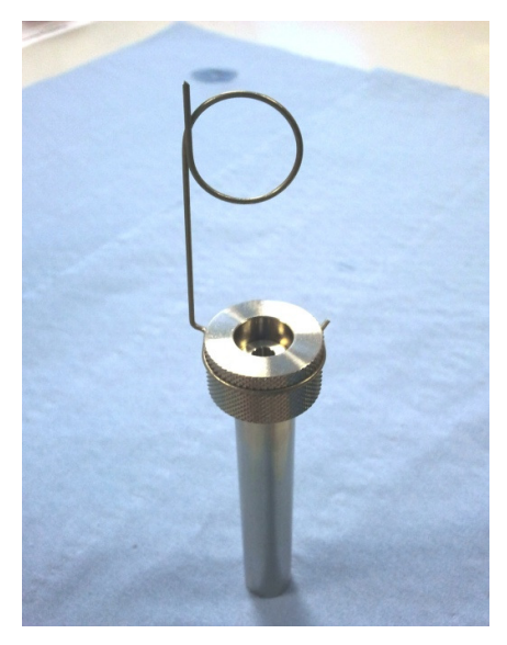
Figure 7 - The handle is attached

8. Finally the handle can be pushed onto the lid. Make sure the wire of the handle sits well in the groove around the lid.